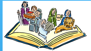
Children's Sunday School

We're taking a Whirl of a journey this year through stories in our NEW Whirl Story Bibles--please join us as we start with the Creation story and move through the Old Testament, meeting new people with fascinating stories to tell us. Our program for kids ages 4-10 will meet in the Youth Room between services starting today and is designed for any child to drop in at any time. We hope to see you there!