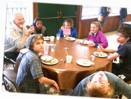
Youth Discipleship Retreat

Winter is soon to be upon us, and with it, some wintery opportunities not to miss!