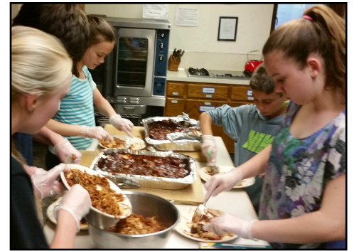
Preparing Dinner for Congregations for the Homeless.