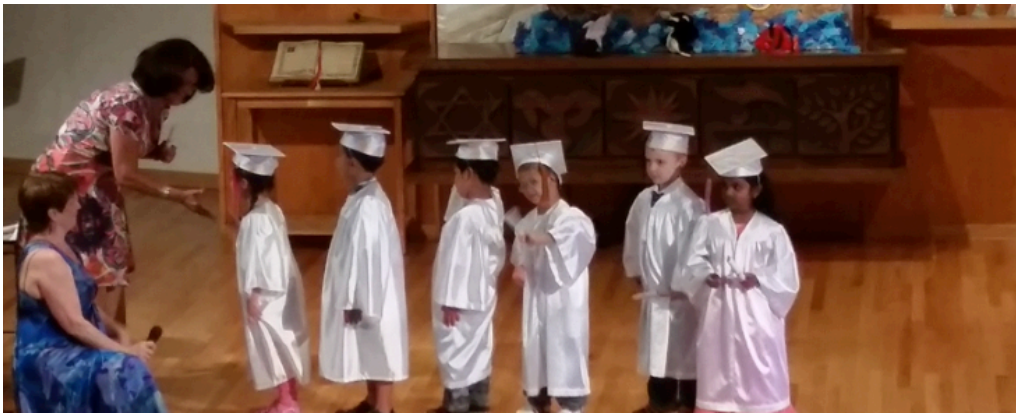
Ark Daycare Graduation 2015